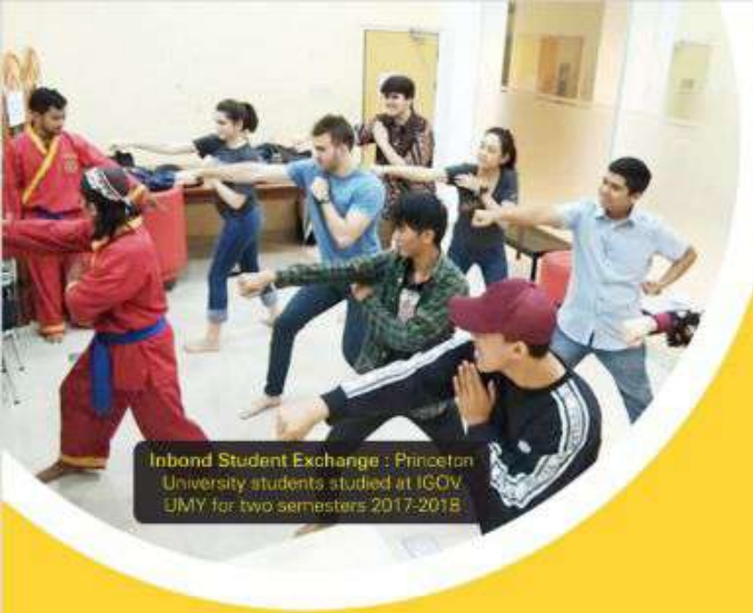
Inbond Student Exchange : Princeton University students studied at IGOV, UMY for two semesters 2017-2018